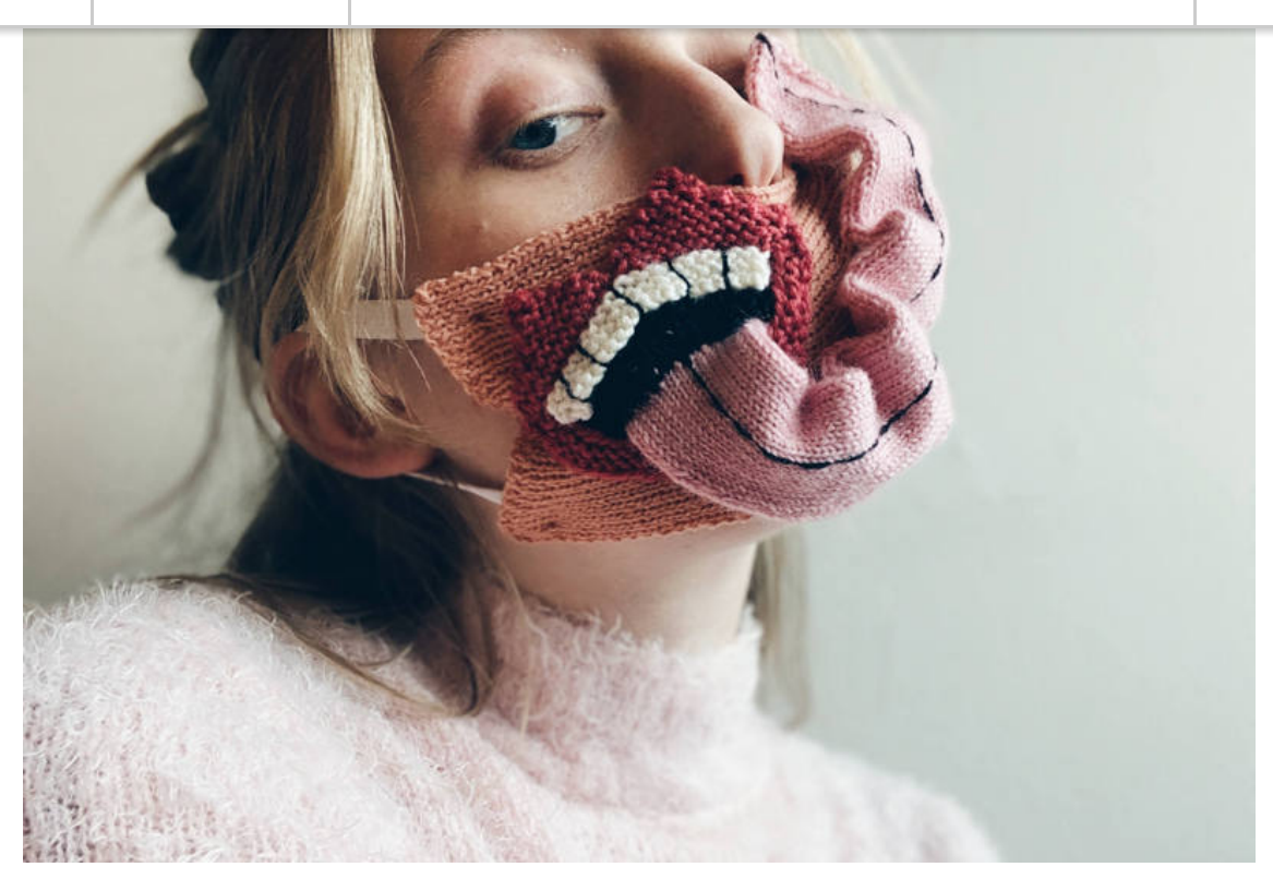
The Most Searched-For Masks of the Moment