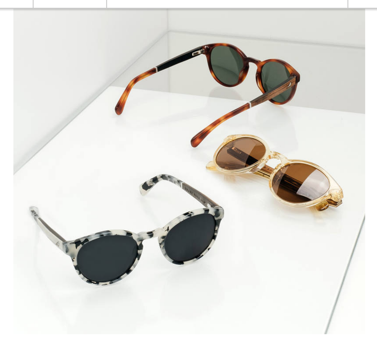
Special Wishlist Time to Support Small and Sustainable Brands