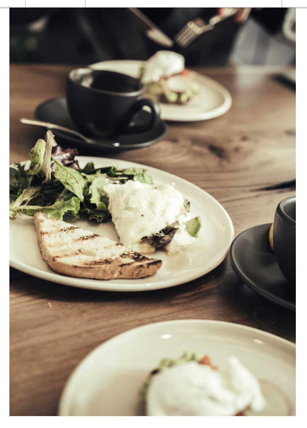
An early noon at Selina Chelsea NYC Travel With Luxiders Magazine Editors