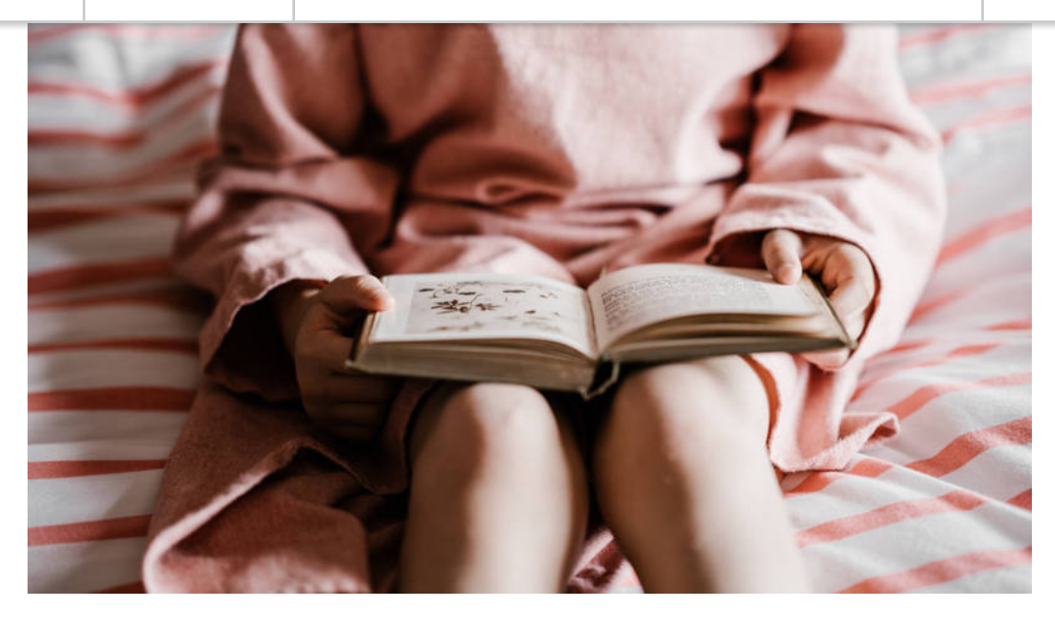
Best Vegan Books | Read the Future