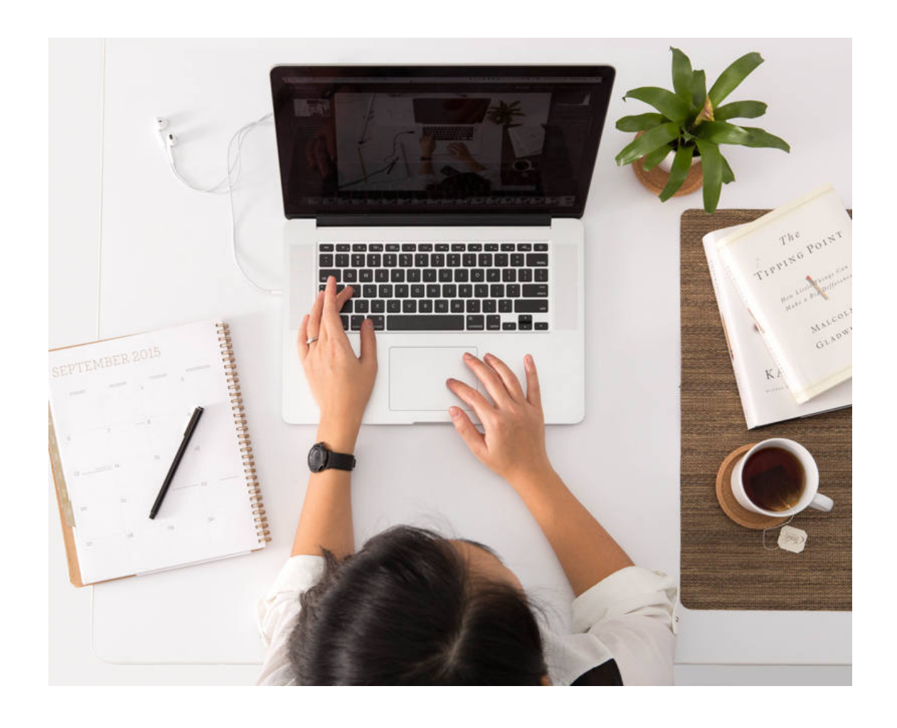
Free Or Low-Cost Online Courses