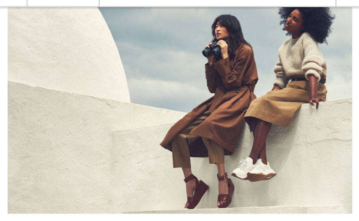
Is H&M Leading Transparency in Fashion?