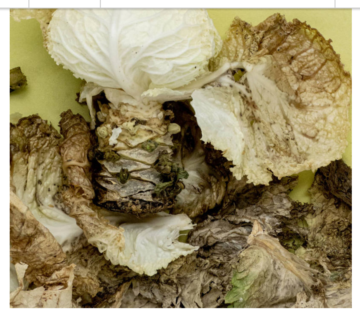
How Big Is The Problem Of Food Waste?