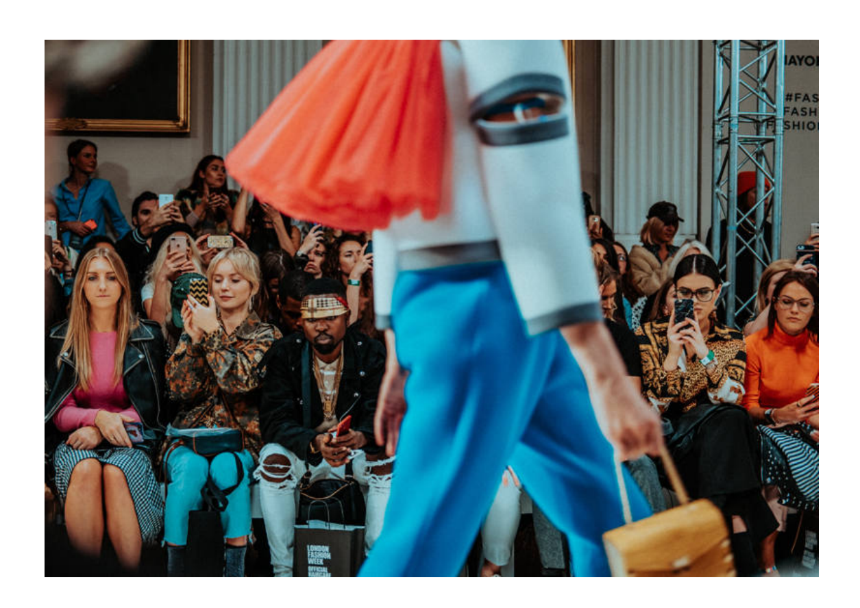
The Future of Sustainable Fashion Covid-19 Update